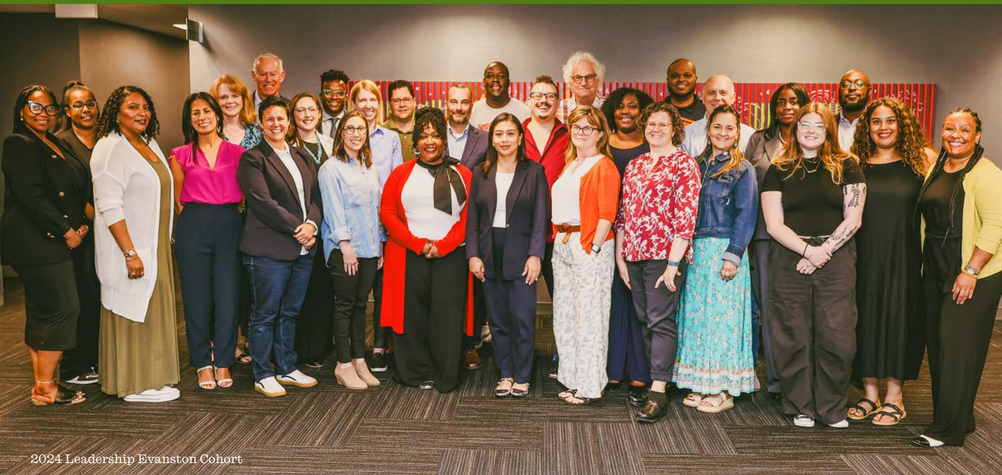
2024 Leadership Evanston Cohort